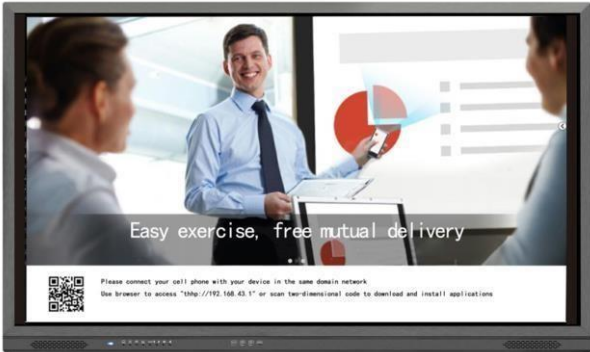
Interface: plug and play